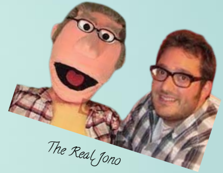
The Real Jono

A: Different studios first started in my mother's kitchen and i put up fake walls and after i did it in chabad.org office late at night