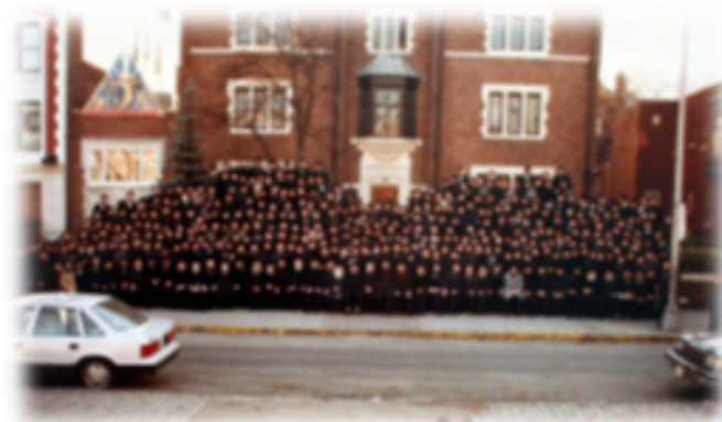
The Shluchim pose for a picture during the first International Kinnus HaShluchim in 5748

The entire Farbrengen that Shabbos was dedicated to the concept of Shlichus. At the end of the Farbrengen, the Rebbe made a surprise announcement, that the next day he would distribute a special Kuntres only for the Shluchim! The next day after Mincha, the Rebbe first said a Sicha and then began to hand out to