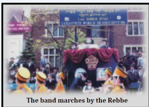
The band marches by the Rebbe

The parade would generally occur each year Lag Bomer fell out on a Sunday. The Rebbe participated in 13 of these parades!