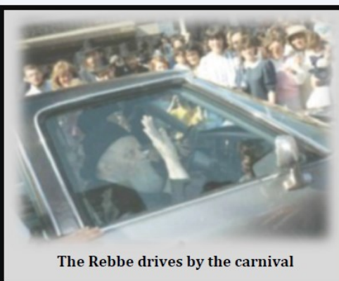
The Rebbe drives by the carnival