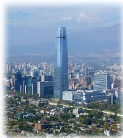
Here is 'Gran Torre Santiago' 64 floors and the tallest building in South America!

Almost every day we have a Minyan for Shachris, Mincha and