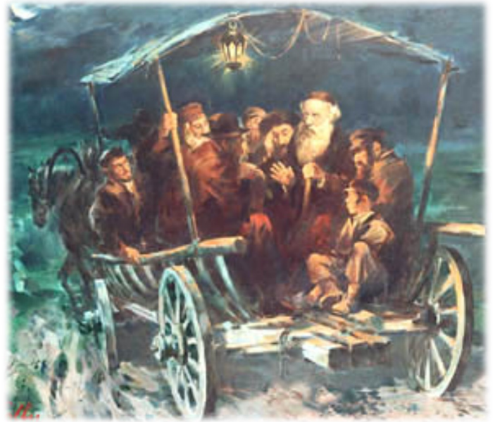
When Napoleon's armies advanced through White Russia, the Alter Rebbe had to flee

Ten years after the Alter Rebbe passed away, two Jews came to this inn. "Do you have food? We're hungry," they demanded. "I do not have any kosher food," the gentile told them. "What difference does it make? Kosher or non-kosher; we will eat whatever you serve." The Goy went out as if to prepare food for them, but returned with an ax in hand. "I know what to do with guests like you," he told them. Motioning them towards the Alter Rebbe's cottage, he continued: "You have only a few moments to live. I will leave you alone to say your final prayers." The Ruchniyus influence of the Alter Rebbe and the fear of death had its effect. The men began to confess their Aveiros. Slowly, they started doing Teshuva. They were sincerely sorry for leaving the path of Yiddishkeit.